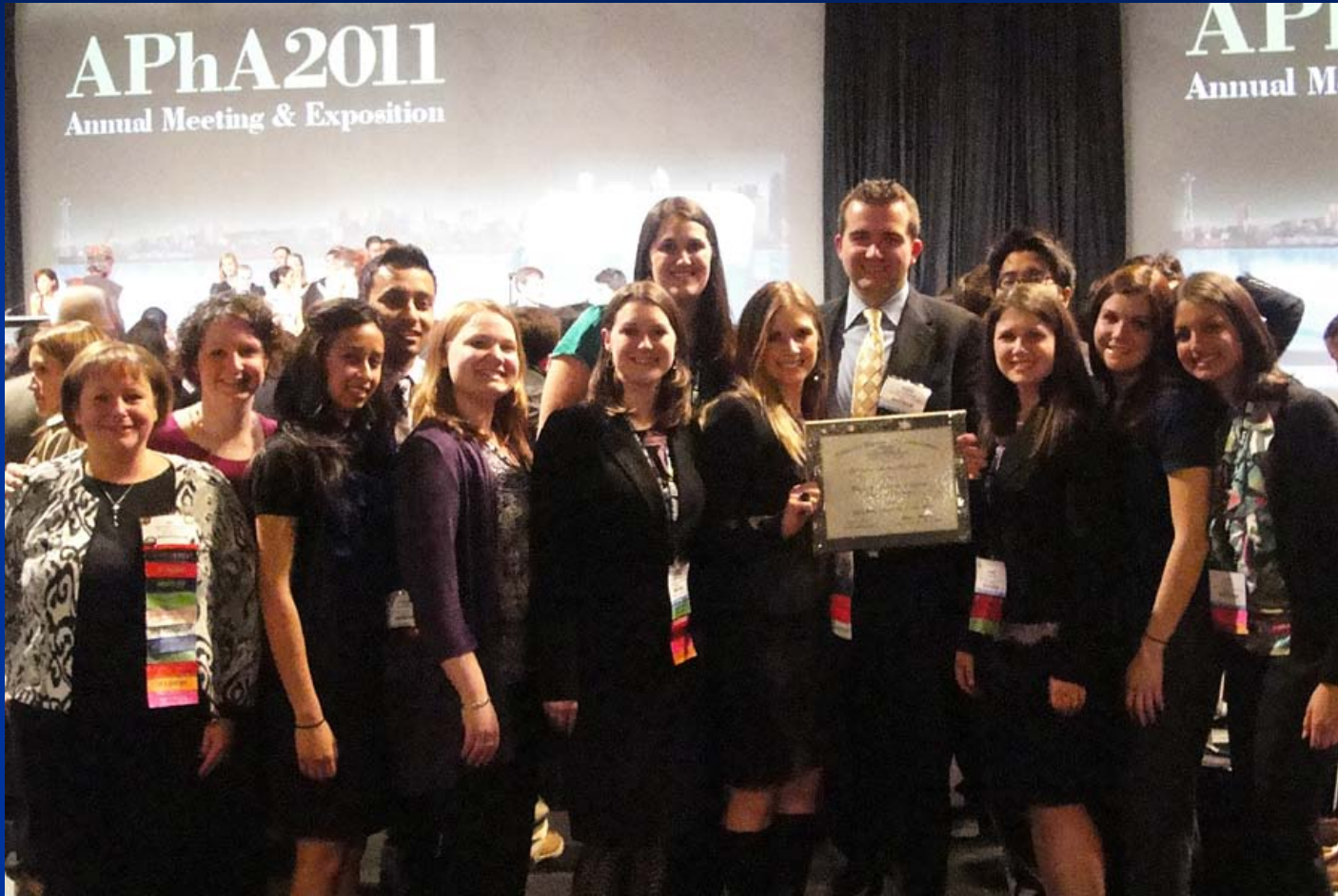
UIC pharmacy students win national award for disease prevention.