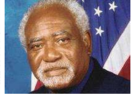
Danny K. Davis