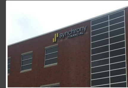
Synchrony Financial Innovation Center