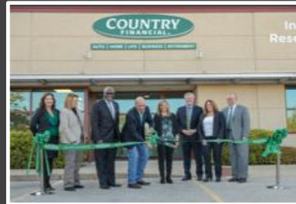
Country Financial DigitalLab