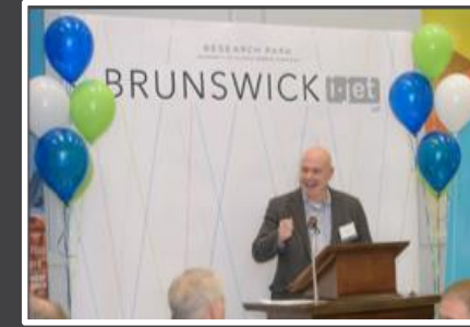
Brunswick i-JET Innovation Lab