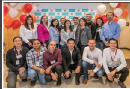
Huawei R&D USA Champaign