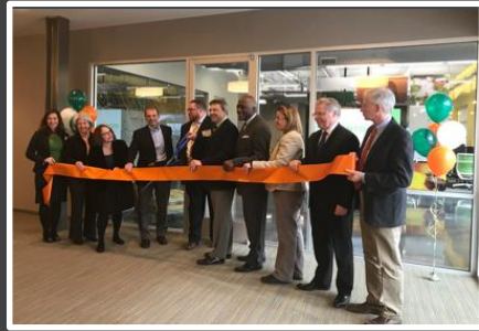
Monsanto Innovation Center