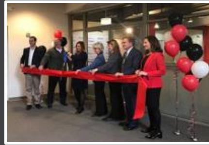
AGCO Acceleration Center