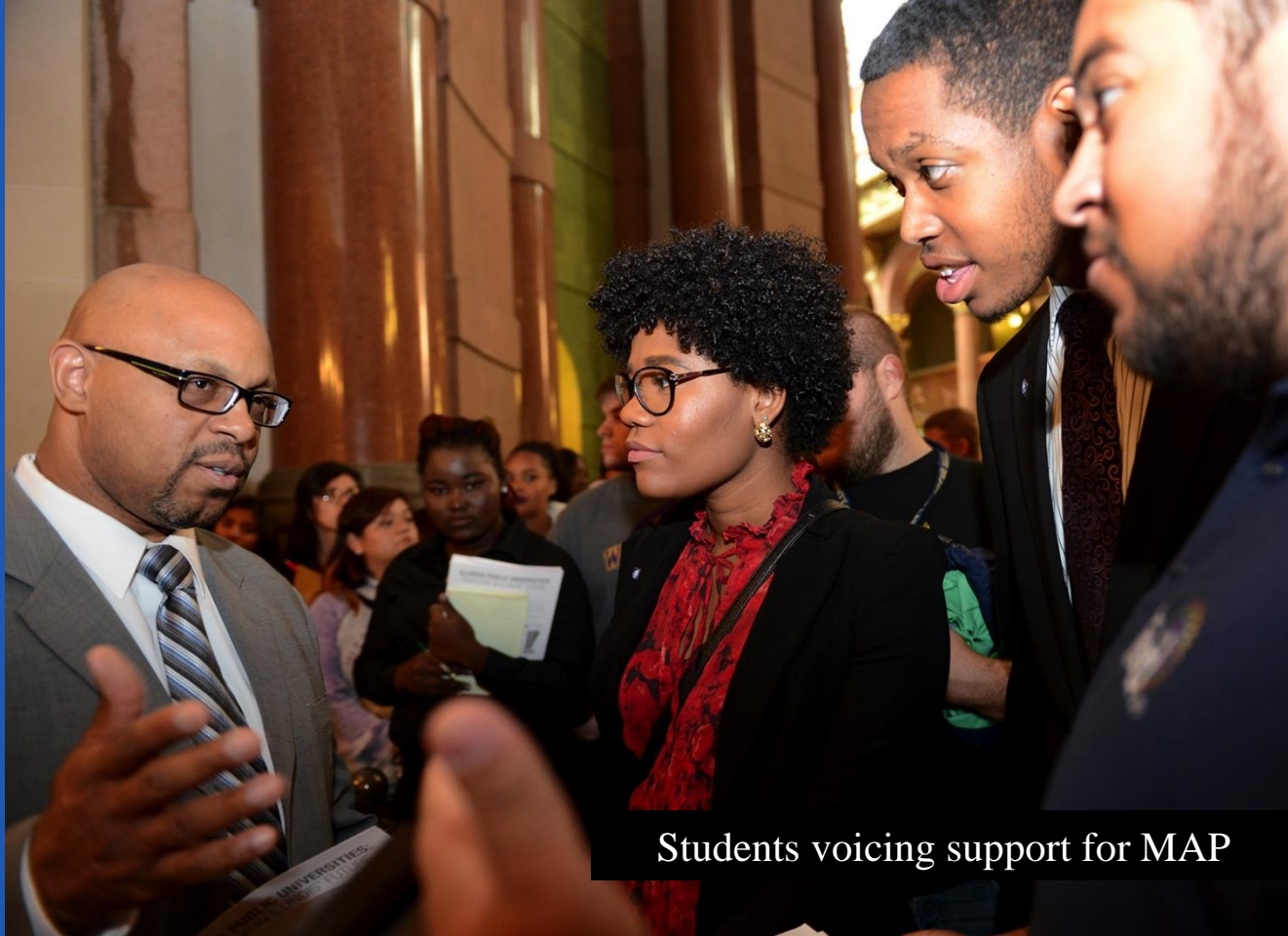
Students voicing support for MAP